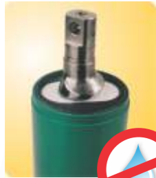
Zero Leakage @ low torque